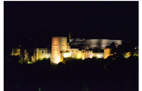
Al'Hambra in Granada