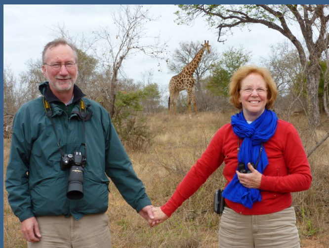
Hanging with the giraffes in South Africa.