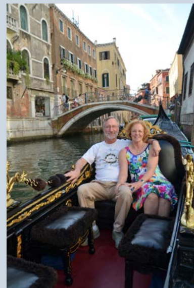
A romantic gondola ride in Venice, Italy

We had a VIP tour of the Nobel Peace Center in Oslo, Norway. We were impressed to see how they explained the mission of the OPCW