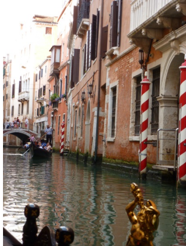
Canals of Venice

Our summer vacation was to Northern Italy. From Milan to Lake Como and Lake Garda then into the Dolomite Mountains and ending in Venice.