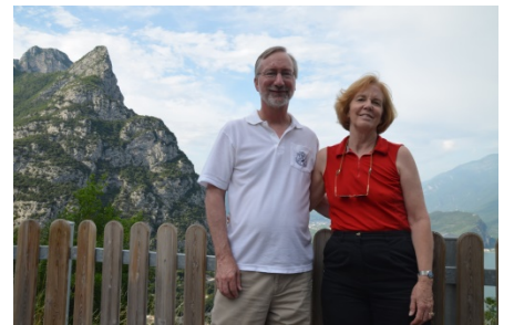
Near Lake Garda, Italy

We chose South Africa and Botswana. It was such a special trip, full of excitement: