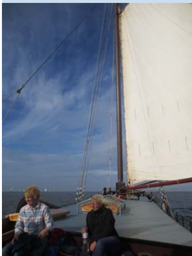
Sailing on the Waddenzee