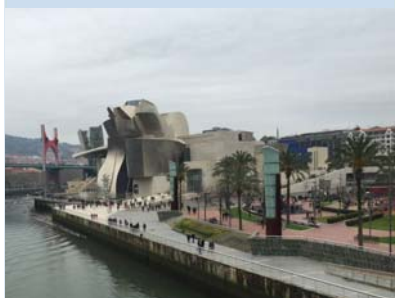
The Guggenheim, Bilbao, Spain

Of course, travel is our hobby. We spent last Christmas' vacation in Oman. While some of you may have been sliding down