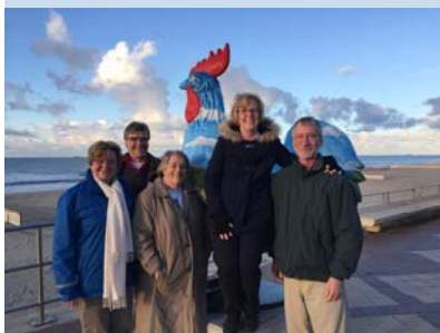
Belgium coast with friends